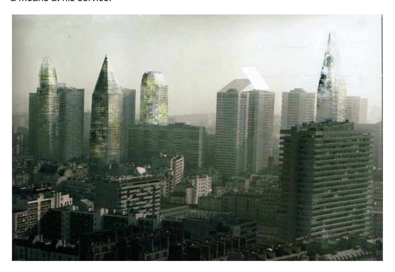
Historical Paris imagined by Jean Nouvell. From «AMC», Le Grand Pari(s). Consultation internationale sur l'avenir de la métropole parisienne, special issue 2009, pp.162-163

The architects will be in charge of the large work group management, underlining the legitimation issue in the field of metropolitan scale, starting a process based on the balance between a "technical capital" and a "cultural capital" within the propositions. The seek for the creation of these kinds of "capitals" has an important element in the representation of the city which became a true subject of the design process, not only a means at his service.