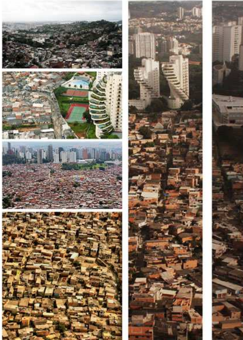
Immagine of slums

For the elaboration of the project I work together with the cooperative Integra of architects and engineer, and the public office of habitat of Guarulhos, Sao Paulo, Brazil.