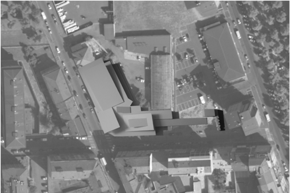
Photomontage of the Project in the Urban Context

But this research has not only been focused on the big libraries, but also on the small libraries and their specific architectural and functional characteristics, to allow that this typology, which is also very important for the society because it promotes the approach of the common citizens to the books and the culture, is more spread and promoted by the local governments, seeing its construction not only as an unnecessary expense of economic and material resources, but as an important investment for the society in which it is built.