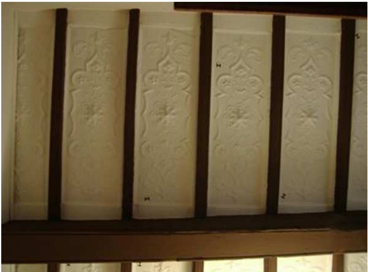
Gypsum ceiling photographed in a private home in Bagnasco (Montafia)

The research is developed in the study of some decorations of the gypsum ceilings of Monferrato, this is a particular building system documented from the end of the sixteenth century until the end of the nineteenth century, that replaces the wooden planking lean on beam warping with a gypsum jetty. The great ornamental effect embellished the interiors of homes which conceded a few simple design solutions.