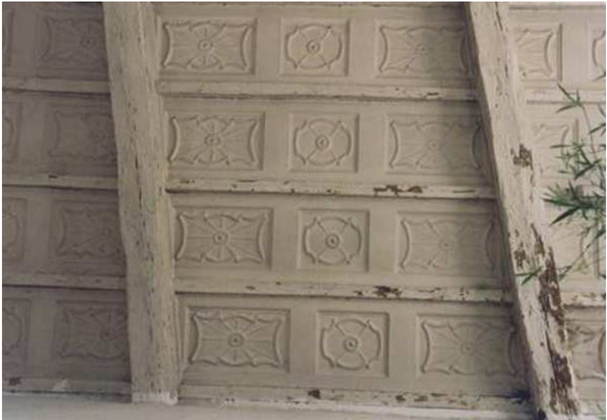
Gypsum ceiling type E

The gypsum boards bearing decorations in relief are geometrically defined by their many decorations and in relation to the latter are spread across a large area sub/regional level. It is precisely for this reason that this work was built on the use of both methods of investigation of detail, both on its study of the territory. Through the latter, such as Geographic Information Systems, we have investigated the phenomenon in context and historical area, in addition, the use of photography and photogrammetry have allowed a detailed analysis of the gypsum ceilings and wooden doors.