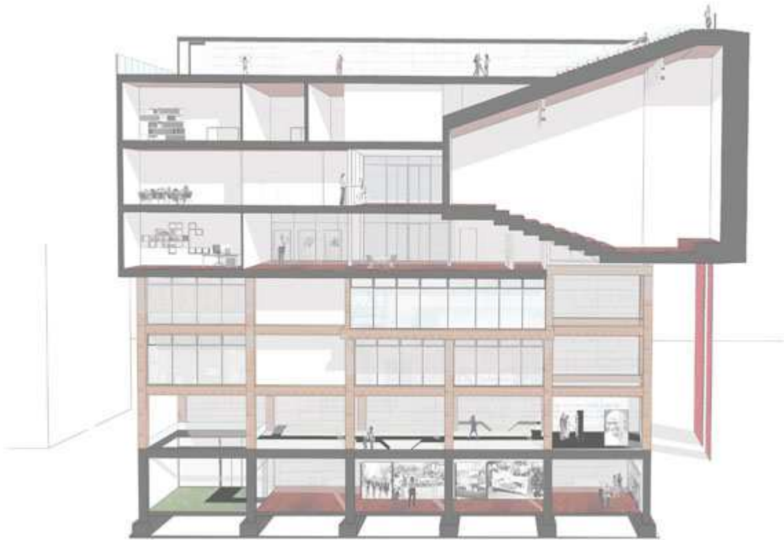
Isometric cross-section, longitudinal section

The announcement was related to a series of documents showing the various structural problems that the building carries back.