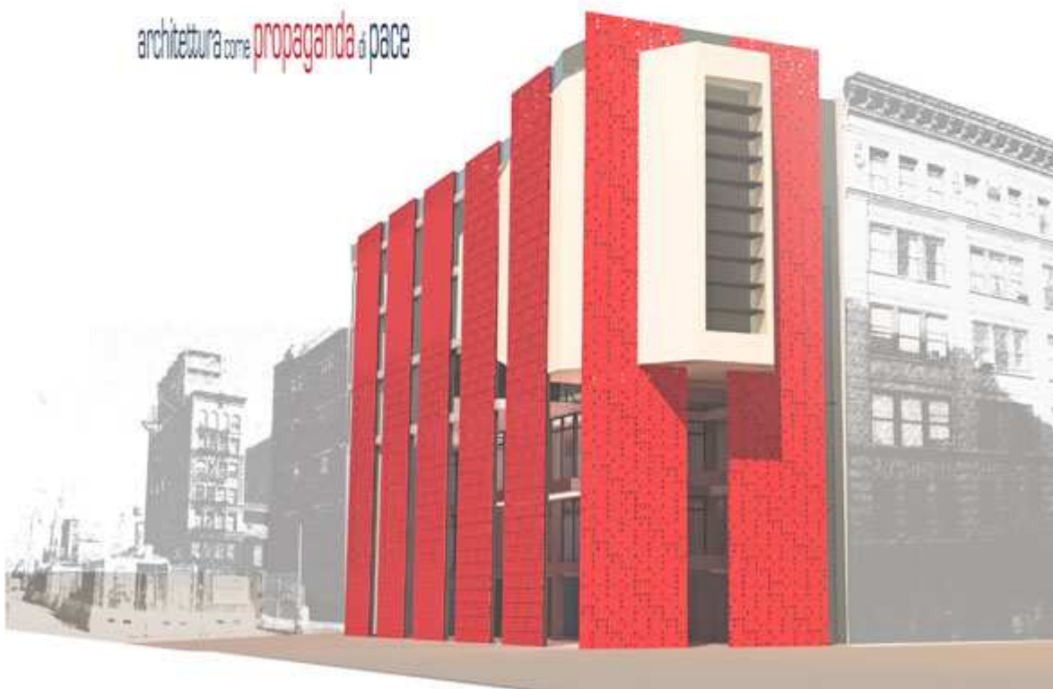
Ideological composition and overall view