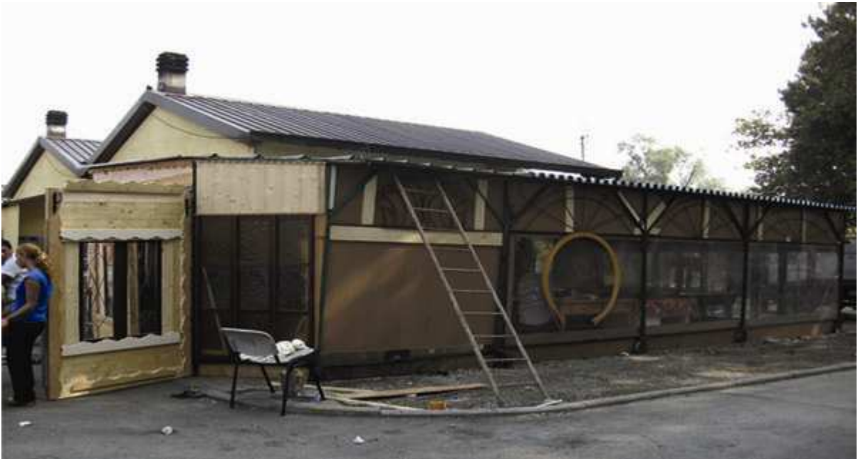
Gipsy camp in via Germagnano, Turin

This thesis proposes to build a living unit using, as basic material, wooden pallet, an object that is often discarded after a single cycle of use. This project is made for the Roma families of Turin that today still live in shacks and precarious housing situations.