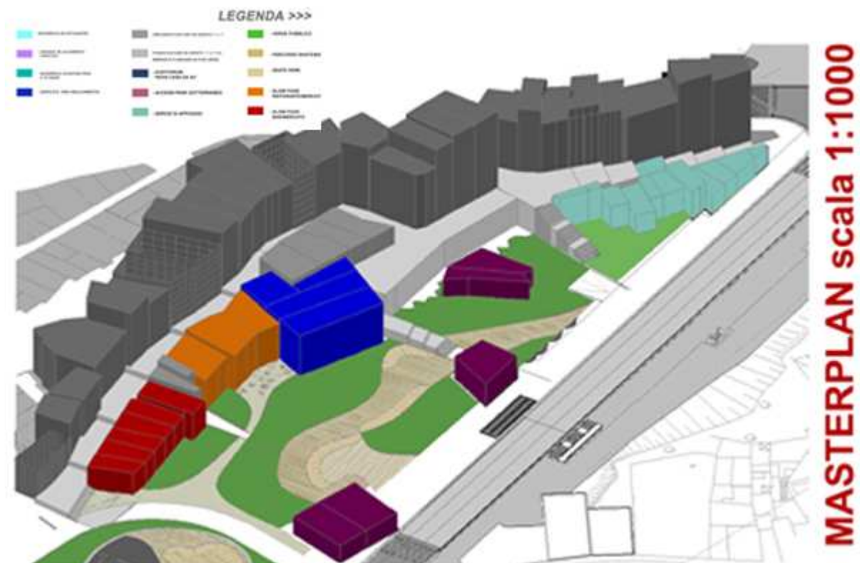
Masterplan area of intervention

The third part describes the specific proposal intervention. Are therefore defined methodological criteria adopted for the conservation and upgrading of the district, analyze their urban environment, architecture, socio-cultural and productive. Advanced is a proposed new functions in commercial sense, culture and tourism in order to create micro-areas that are particularly characteristic and at the same time integrated with each other thereby allowing the buildings taken individually, as well as within the district, to recover autonomy and also generating a series of virtuous circles in both economic and social, that is precisely cultural.