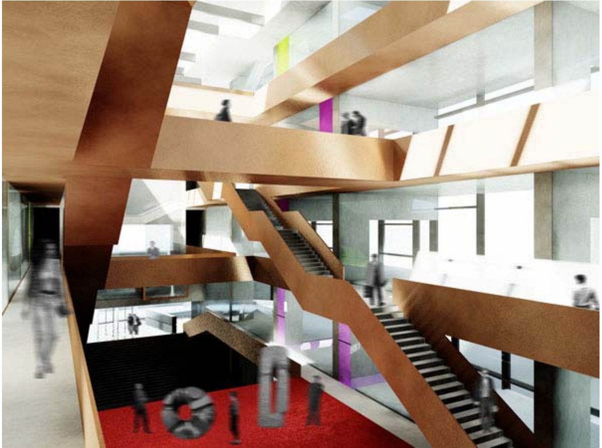
Central court interior view