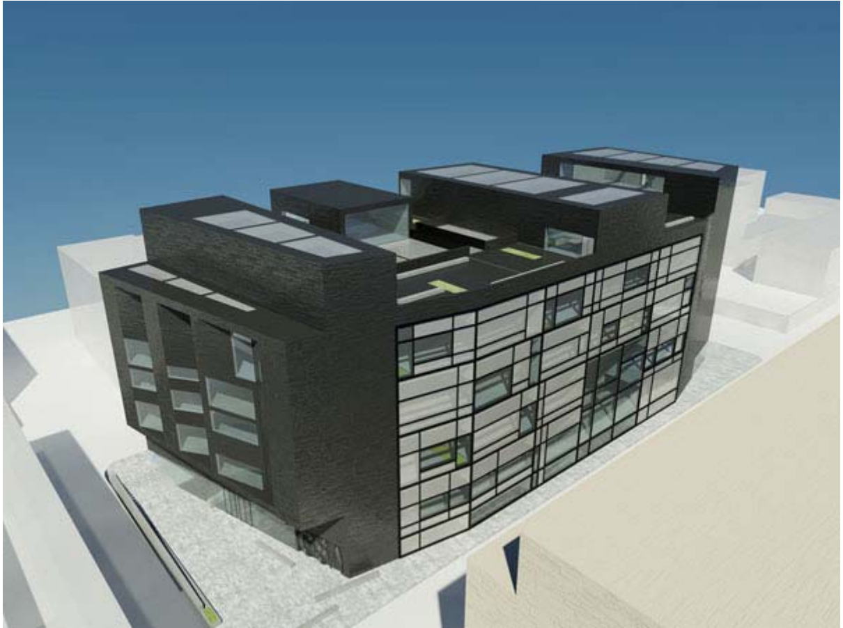
Southern view toward new school

The planning approach has been somehow “evocative” of the Mackintosh aesthetics cultural sources, not of the historical School shapes, hence, the evolution of the project goes along key themes, such as contrast. This is shown, for example, by the relationship between the dark hall and the wide top-lit central court, between the open-ended nature of the access and the sharp outline of the whole building, between the quadrangle seen as social space and the patio garden representing quietness, between dark slate and bright opal glass.