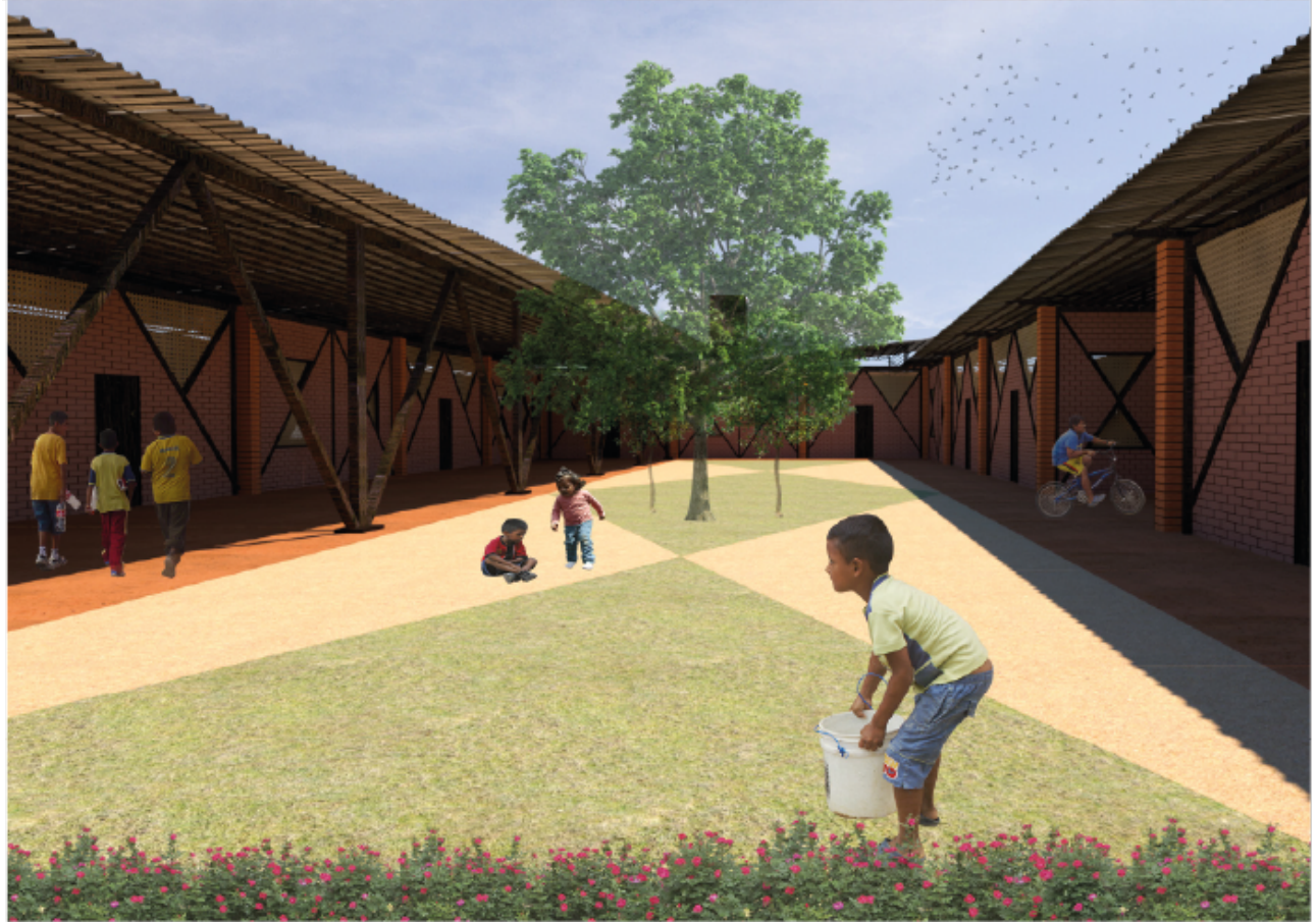
Figure 2: Representative renders: fist CNRA Market, School of the Woman's house center