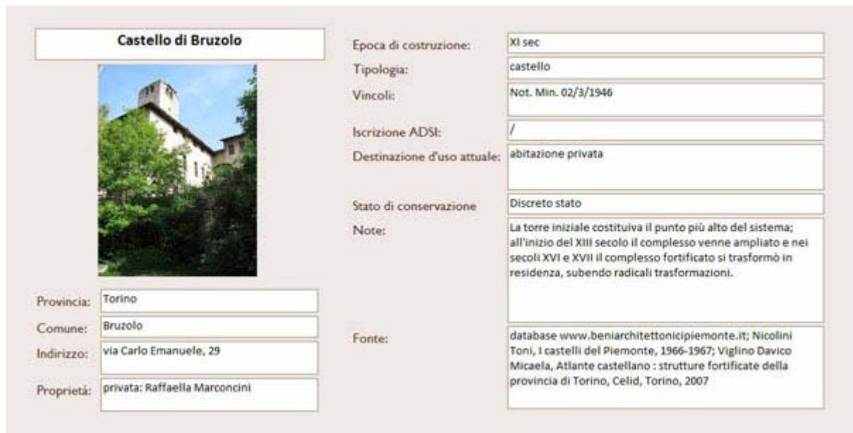
An example of building's register

Considering the close connection between problems relating to preservation and reuse of historic mansions and theme of their knowledge, it seemed useful to carry on a study and inventory campaign about piedmont dwellings, in order to focus on and understand the presence and the distribution of these assets in the region.