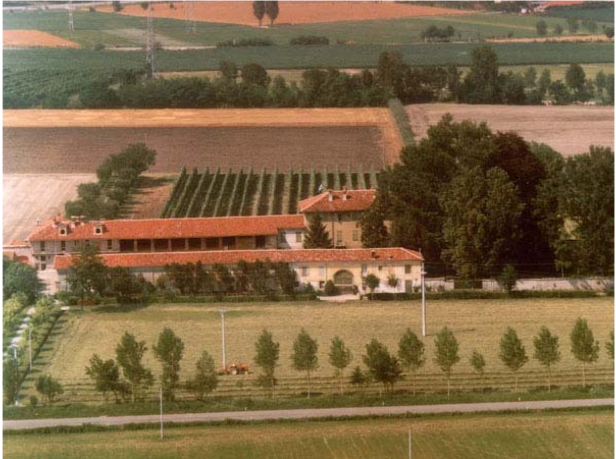
One of the mansion on Pinerolo's territory

The situation of this area, therefore, has been a matter of interest both for the close connection between different assets, and for evaluation of the importance into searching for compatible functions within the dwellings that nowadays have no appropriate use. Lastly, this case was also deemed very interesting in order to prove risks that carelessness against a single building inevitably pours out on the whole context of reference, especially in the absence of an adequate protection measure (it happens in this case precisely), that ensures an integrated protection, not only of individual mansions but also of the entire territory related to them.