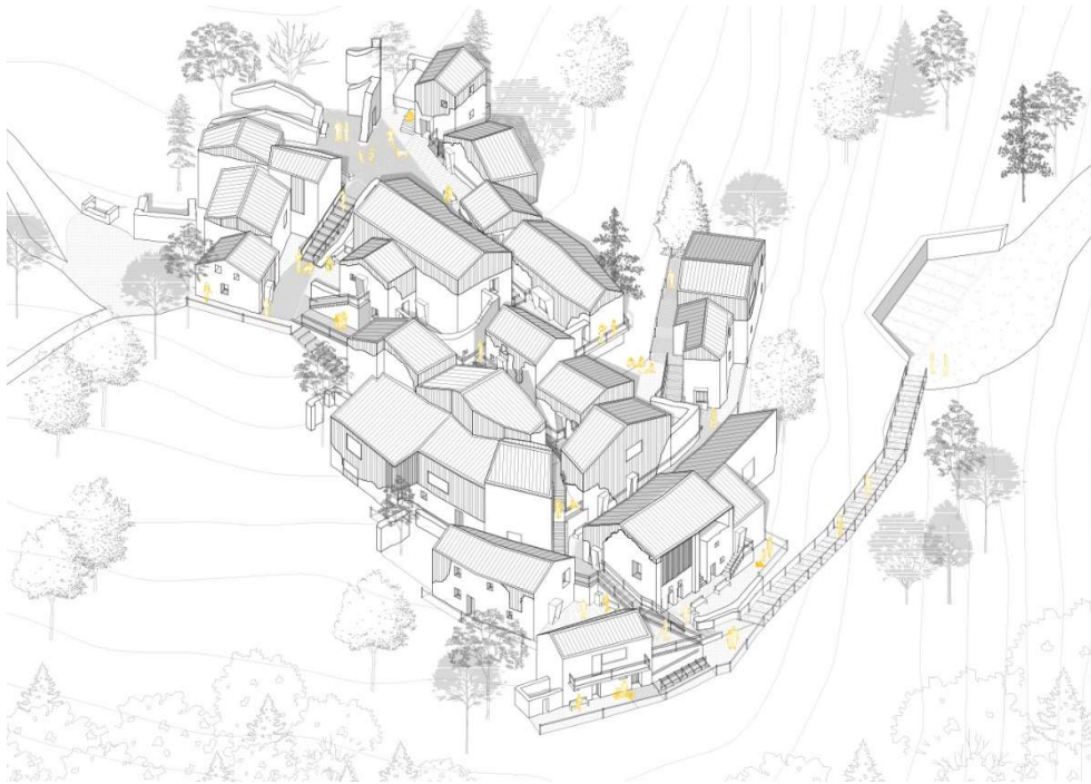
Figure 2: Project axonometry of the Querio village