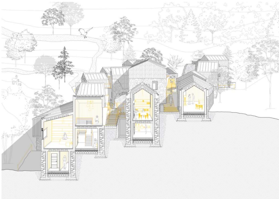
Figure 3: Perspective section of the project of the Querio hamlet