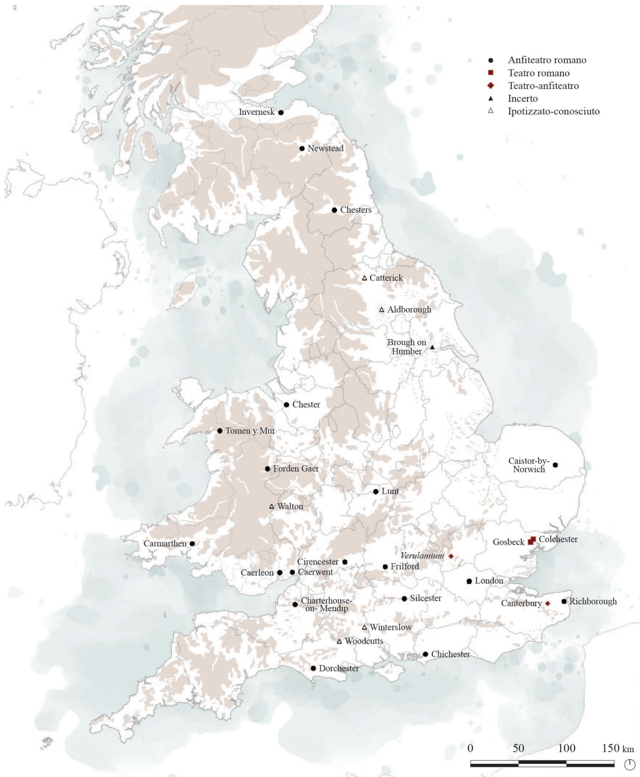
2. Fig. 116, p. 237. Typological classification of recreational buildings and for shows in Britain. Web-Gis: https://learn-students.maps.arcgis.com/apps/instant/interactivelegend/index.html?appid=e4d299a5a3e347ac895dce0c193f0add