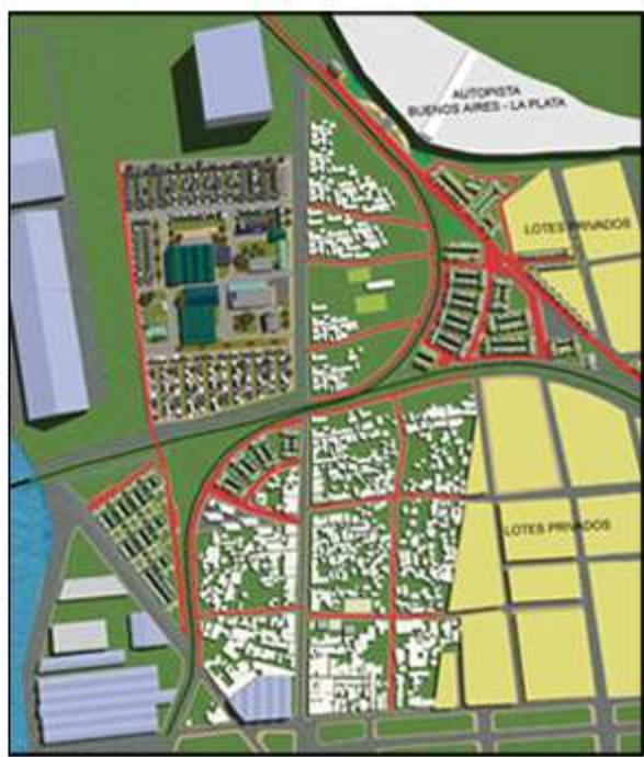
Plan of Villa Tranquila and Masterplan of Programa de Urbanización de Villa Tranquila

Particular attention has been paid to the present and future role that competes with local governments. The work experience at the Dirección de Planeamiento Urbano of the Municipalidad de Avellaneda was an interesting opportunity to be involved in the elaboration and application of a specific government program, concerning the development of an informal slum: the " Programa de Urbanización de Villa Tranquila ".