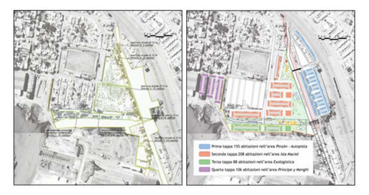
Plan of Villa Maciel and Masterplan of Programa de Urbanización de Villa Maciel

The aim of this work is to evaluate which conditions the housing policies should contemplate in order to guarantee effective and lasting solutions. First of all, it is necessary to consider the urban dimension, trying to "realize cities", besides just building houses: planning public spaces, educational, sanitary, cultural and recreational equipment to consolidate small centralities; defining a good accessibility; planning employment generation strategies; thinking about the location of the new residential areas, according to a plan of urban development; studying residence typologies, in relation to the specific climatic, social and cultural conditions of the place where they will be realized.