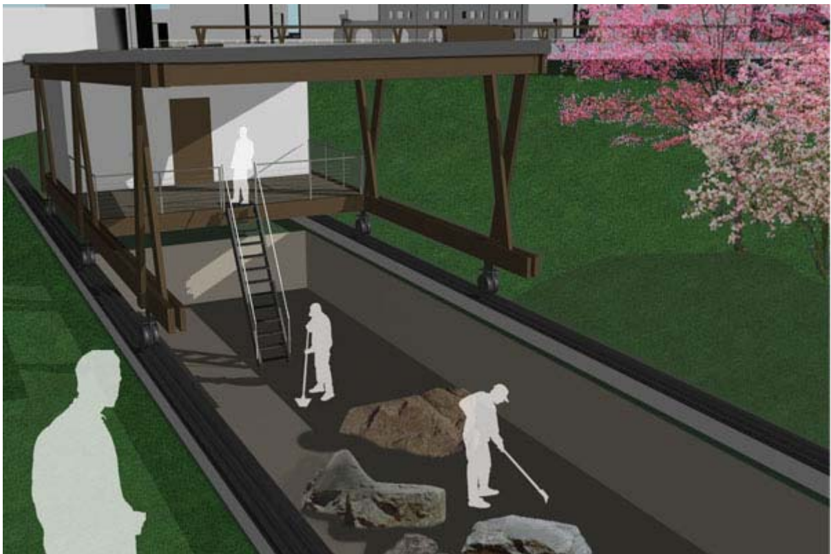
Trolley for excavation

The findings of the theater are visible through a walkway that passes over them at a height of almost three meters and can reach a height of the area outside the walls. The foundations of the stage, opposite the front wall remaining, which is used as a fifth stage, stands a staircase for the spectators and a stage. Outside the walls, instead of the barracks, the existing building rises as restaurant-pizzeria, and it is remade with the same structure of the building for teaching. To overcome the visit of the amphitheater-convent, adjacent to the restaurant stands a walkway landscape of path which reaches six metres tall and gives you a comprehensive look at this Roman Aosta corner and can become the subject of a evening light show.