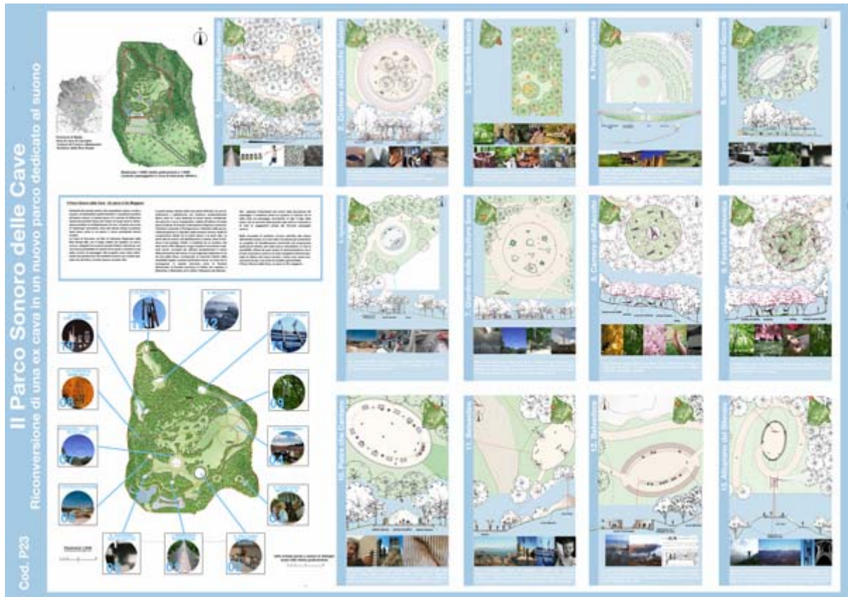
Summarizing sheet of different areas drawings

In the restitution demand of an area took away from the nature, was seen the chance for present a project that suggest something of different by the usual naturalistic park; so was took advantage from the great possibility offered by the thesis work to cope with a sperimental assey, and tring to join the different founded cases on employ of sounds in the green areas in a single thematic park; the quarries' sonic park.