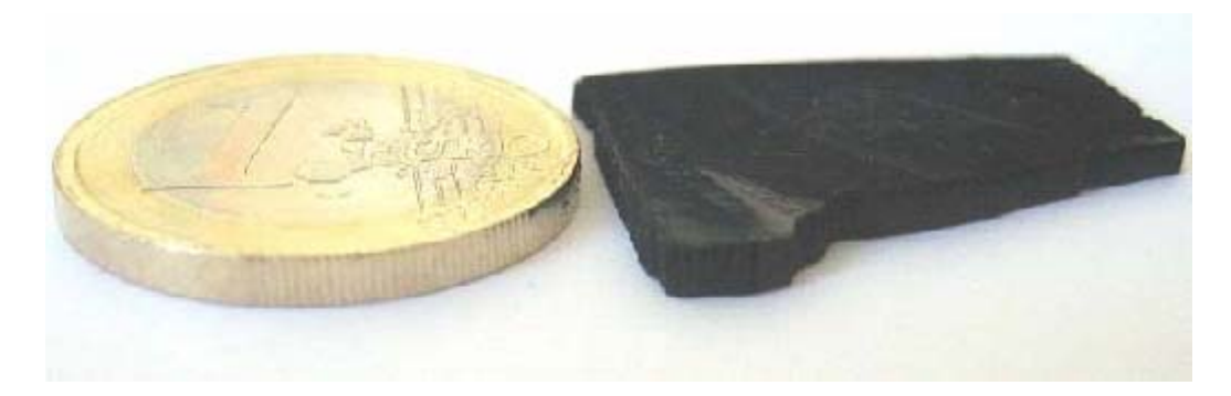
Figure 3 - Photos of the "carpet" of carbon nanotubes

The results achieved were compared with those obtained from a previous testing made by Canepa Architect. This past testing, unlike ours testing, has not only brought improvements but it also showed deterioration in all points of view. The flexural strength of Canepa's samples is about 3,85 N/mm<sup>2</sup>, the flexural strength of FCCT 189 is about 10,08 N/mm<sup>2</sup>; the compression strenght Canepa's samples is about 15,53 N/mm<sup>2</sup>, whereas the compression strenght of FCCT 189 is about 72,04 N/mm<sup>2</sup>.