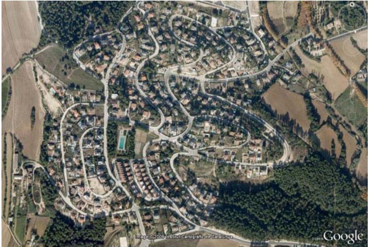
Satellite photo of a urbanització in the town of Lliça of Amunt

The first part of the thesis focuses on new ways of expanding cities and the effects this phenomenon has on the territory and specific land consumption. As previously mentioned, one of the constants shared by these new urban forms is the fact that more land is used than in the traditional model of the compact city.