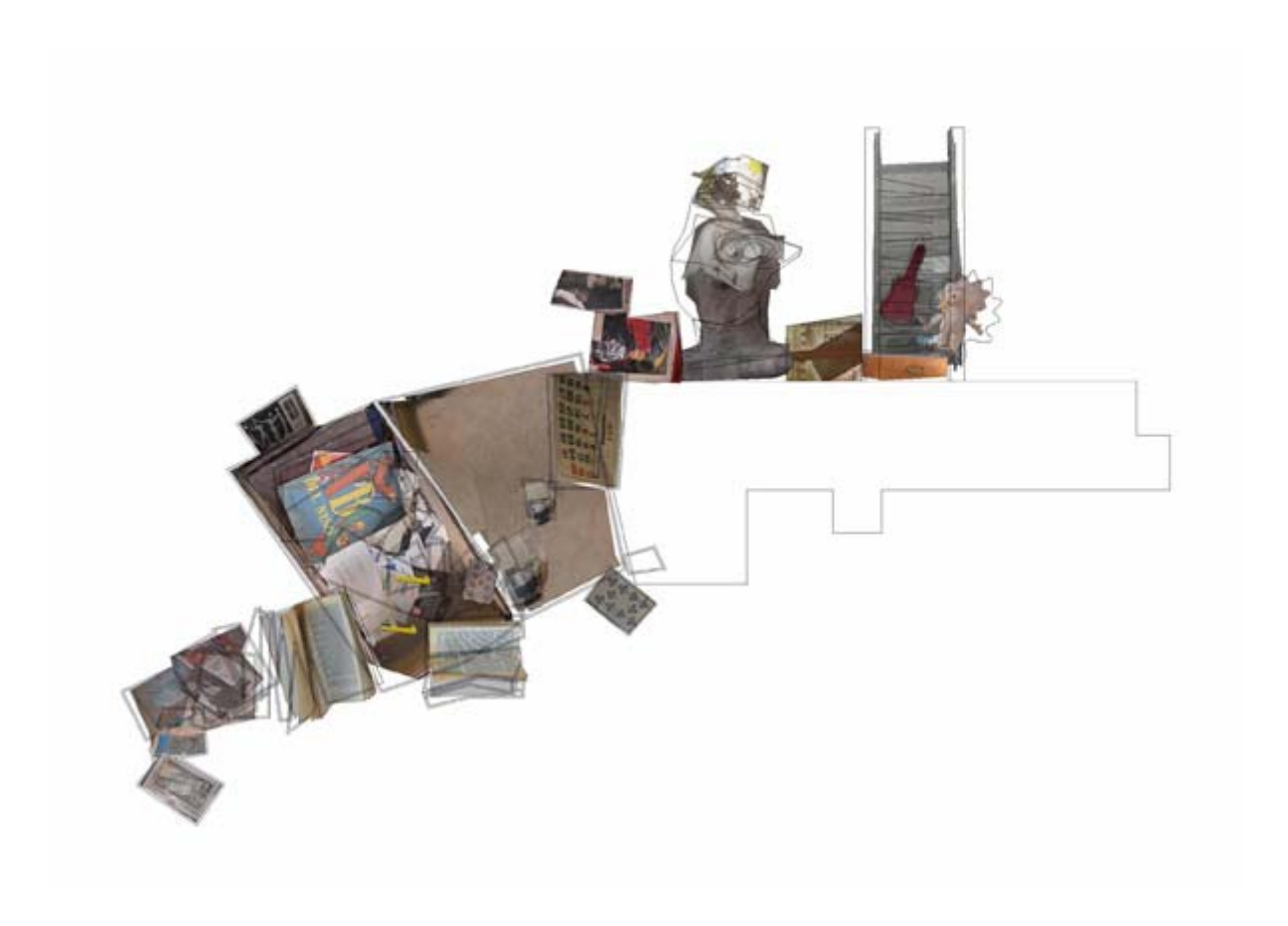
Contents for a container

The approach I have adopted strengthens the objects and forms the spaces that will revive the Palazzo del Lavoro .