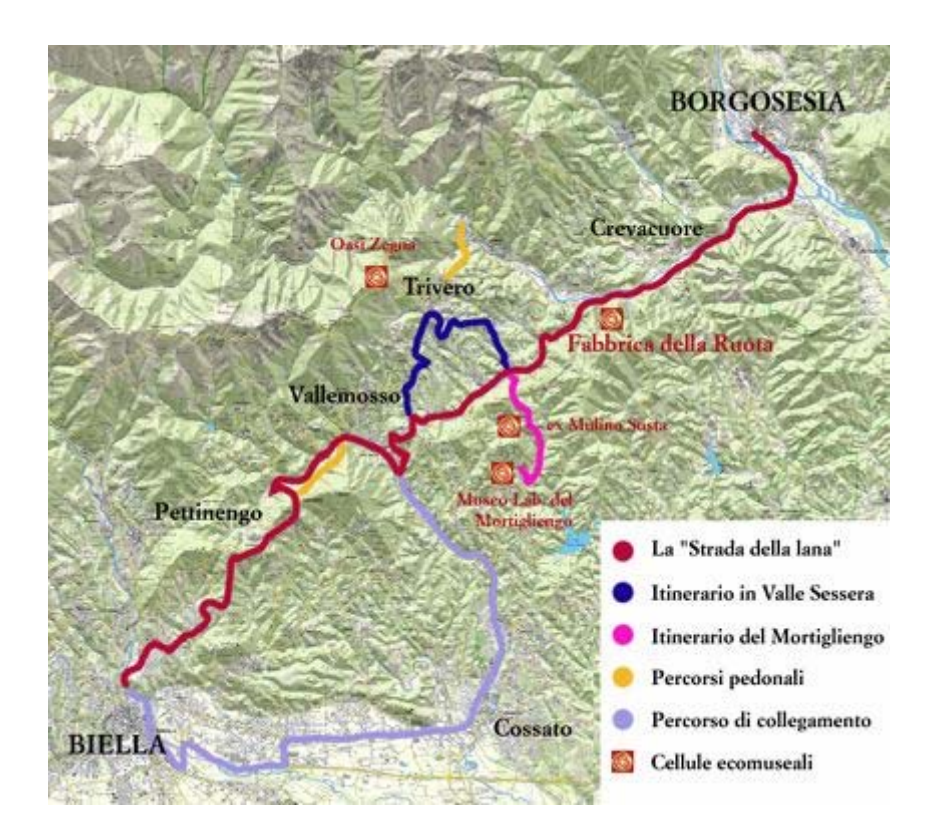
The Road of the Wool, SITA basic mapping of the Province of Biella, www.docbi.it

The research starts from a preliminary phase of survey and exploration of the Biellese territory, as well as of the sites of industrial archaeology arising all along the route, which are very different in their typology and state of preservation. Through the collection and processing of economic and demographic data about the culture, infrastructure, services and environment, and from the analysis of the current route and industrial buildings conditions, even on a structural and deterioration point of view (through the creation of a suitable catalogue data sheet), a summary of the area and system of properties results, which allows an assessment of its disposable potentials, both locally and nationally. Four alternative profiles have been developed through the application of a typical evaluation tool, the SWOT, used to summarize the main features of the property and territory, arisen during the first phase of analysis, as well as to identify the strategic objectives.