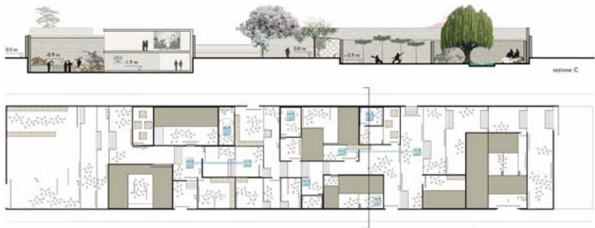
Cross section and masterplan

The final project is focused on a portion of the original site (is one of the stripes created on the workshop's project) and it aims to the creation of a space that fits the aggregation costumes of Chinese population, interpreting in a modern way the theme of the Chinese garden.