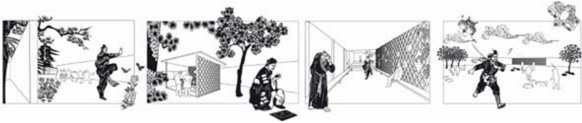
View of different “rooms”

A peculiar attention is given to the choice of vegetation, based on the Taoists symbolism, and to the modulation of the different gradients of privacy depending on the activities. Screens of various patterns, thickness and density are used to filter the passages between the rooms and to create the “furniture” of the garden.