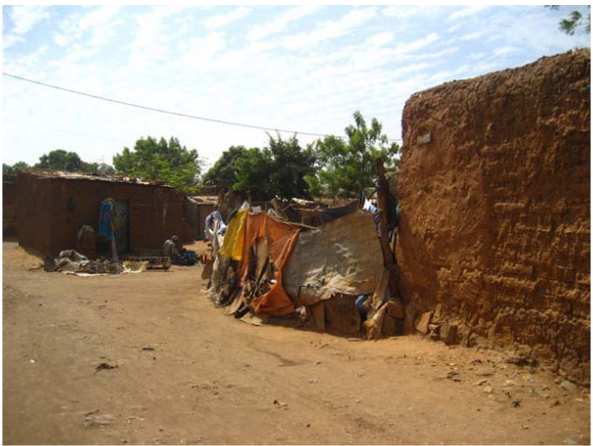
District of Banconi: the housing situation

The decision to operate in a urban area, inside of an informal zone, deprived of infrastructures and basic services, has certainly involved many difficulties to the conception of the project.