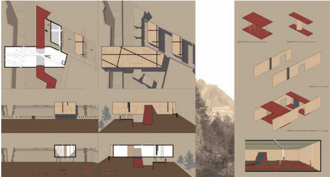
The breach of the bastion of Roudour

The bastion of Roudour has an opening in the walls, dating back to an explosion of 1836, which in fact stops readability. The risk is to reconstruct the breach in an original style, making only a few necessary precautions to distinguish the intervention from the existing.