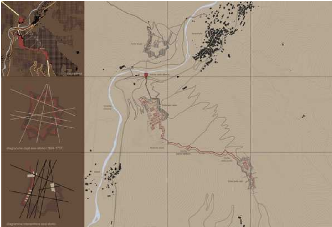
The military barrier