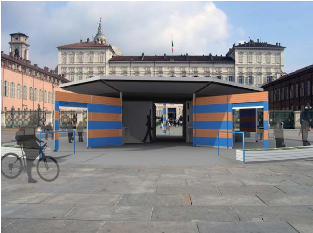
Open info point, Piazza Castello, Torino

Finally, inspired by artistic interventions of artist Daniel Buren, I designed a path made of totems in Piazza Castello, visible from several streets that converge there. The totems' shape is inspired by two basic elements of the panel: the hinge and the alternation of staves in a horizontal pattern. The highest totem, next to the info point, symbolically represents the seventeenth-century octagon of reference.