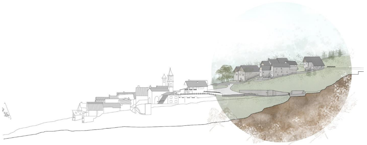
Territorial section, high mountain village, Ferrere