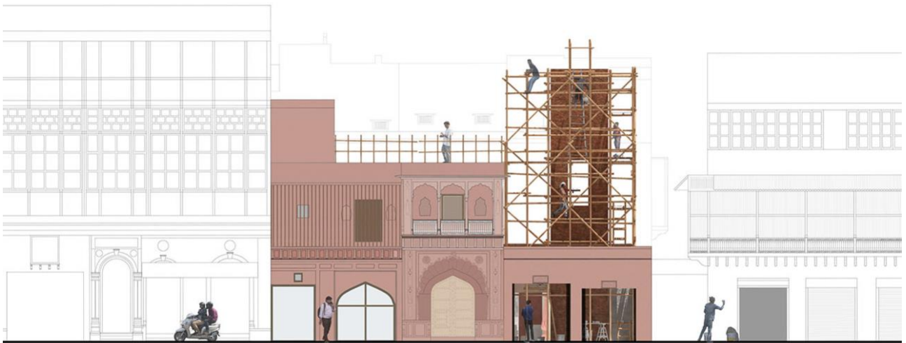
Front elevation of the adaptive reuse project design.