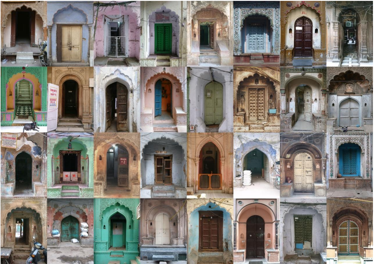
Abacus of havelis gateways.