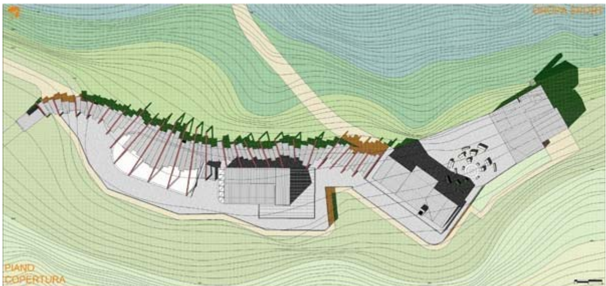
Oropa Sport - plan

Biellese history is fundamental to choose the right plan because, for example, it lies in the recovery of the old electric tramline Biella-Oropa (1911-1958). The proposal of the new tramway Biella-Oropa becomes functional to reconstruct the old line firstly and to reinstatement all those values and old buildings nearby (hydrotherapical and religious centres), to bait new investment facts and a kind of tourism not religious only. Moreover the exclusiveness of the tramline, that's not just a simple means of connection there and back , takes a landscape value (and touristic one) with its own importance.