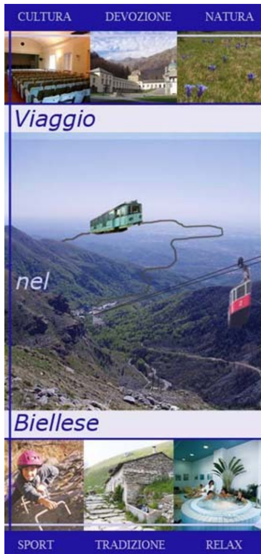
Dépliant – territorial infrastructural system of Biellese

The recognition of the site “Sacred Mounts of Piemonte and Lombardia” in the List of UNESCO world-heritage (Paris, July 3 th , 2003 – “XXVII Session of the world-heritage Committee”) decrees their historical and artistic “universal extraordinary value”. That identifies Oropa in an important international object for the planning management of its properties.