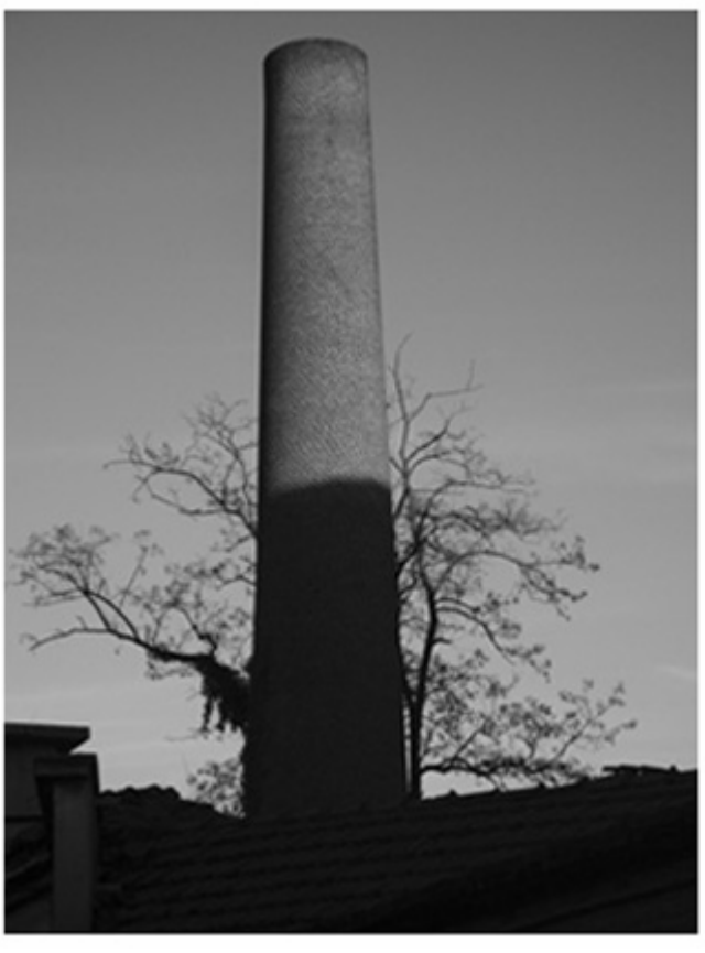
Some important visits to Molino Re

We found two Operative instruments for the Ecomuseum knowledge and development: