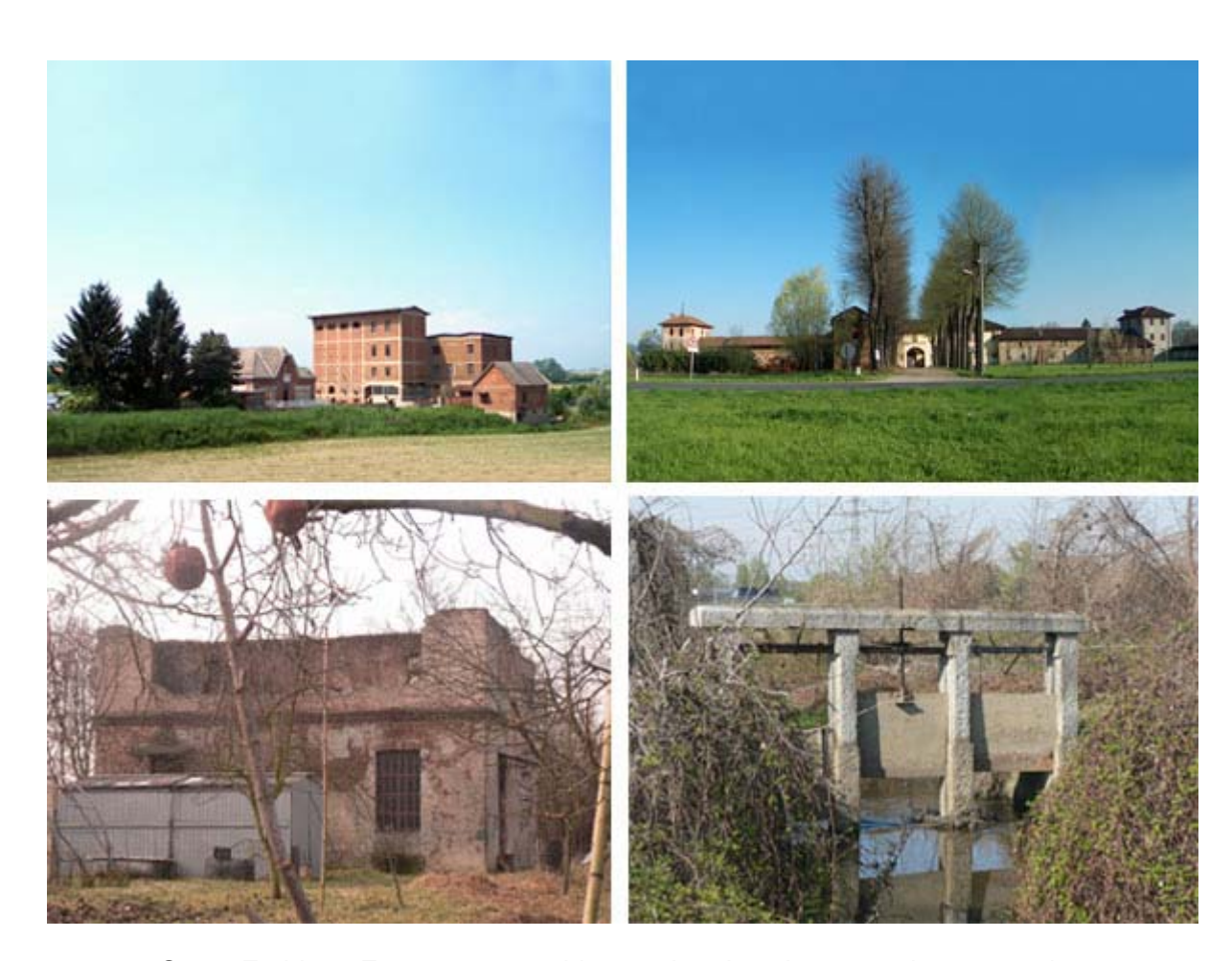
Some Freidano Ecomuseum architectural and environmental emergencies