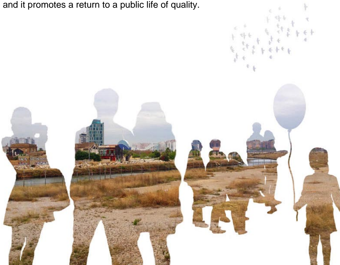
Fig. 1 People build the space and they give him quality

This typology of reactivation makes the residents actors aware of the space in which they live and it promotes a return to a public life of quality.