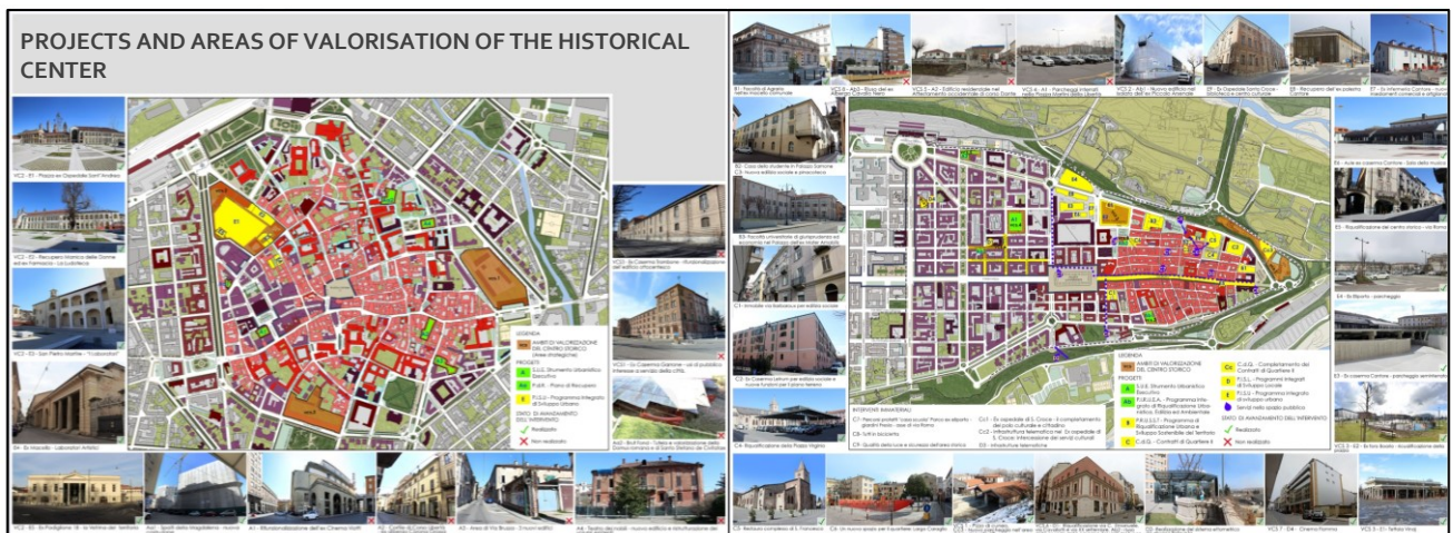
Fig. 2 - Morphological-visual analysis carried out on the historic centers of Vercelli (left) and Cuneo (right)