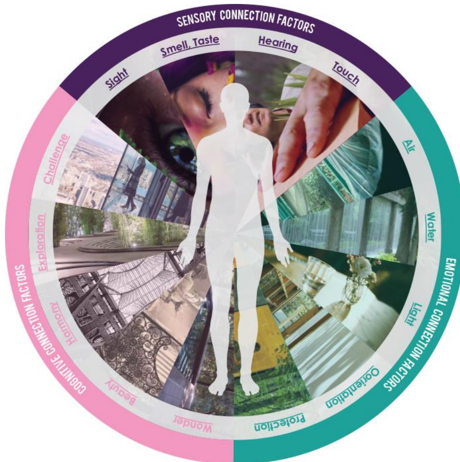
"The 14 connection factors of the Protocol of a scientific biophilic design", elaborated by ROXANA GEORGIANA MARIAN & GIULIA NOTA

that have had a first chance to collaborate in the design of Biosphera 2.0 1 . Biosphera is a scientific project where researchers have monitored and collected data relating to the energy system and the human physiology of the 32 occupants who succeeded within the 25m 2 housing module during the 8 stages of the planned itinerary. The thesis work, with the case study of Strambinello, goes beyond this project because: