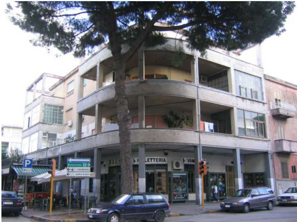
Le Palazzine, part of – via Terracciano

Application of the Preservation Plan to part of the popular quarter called "Le Palazzine". The aim was to produce a model for the restoration of these specific buildings in line with Italian laws and the preservation of modern architecture, with particular attention to the present needs of the inhabitants.