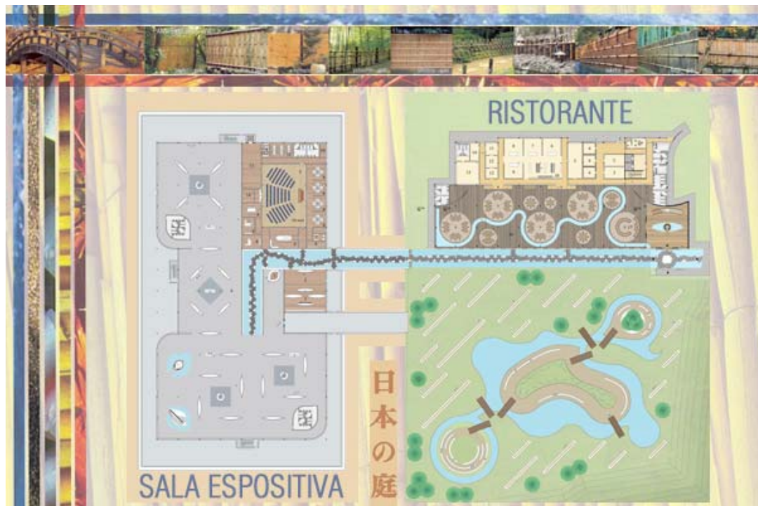
Ground-floor plan of Environment Art Forum

Each of these represent one of the aim of the project: ENVIRONMENT, attention for environment (relax garden); ART, a project to give vitality to Annaka (mirror’s garden); FORUM, a meeting place (amphitheatre garden).