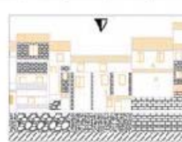
Prospetto lato scarpata