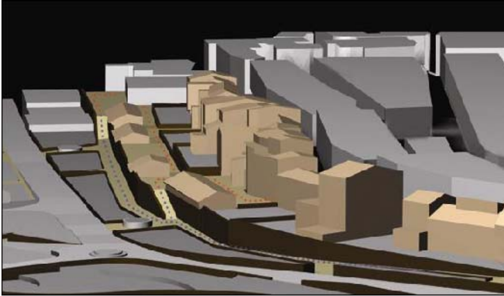
La Spina and its fort, according to the new project

The project of this thesis wants to be a spur to the renovation of La Spina, its fort and the whole quarter of Las Peñas, respecting its historical, architectural and environmental values, as well as giving it new life.