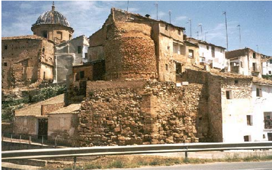
Requena, still clearly visible the walls of the Arab fortifications

The Spanish town of Requena is about 70 Kms from Valencia, in the direction Valencia-Madrid; it used to be a military outpost at the time of the Arab domination and it was an important trading centre till few decades ago, thanks to its location on the border between Castilla and Valencia plain.