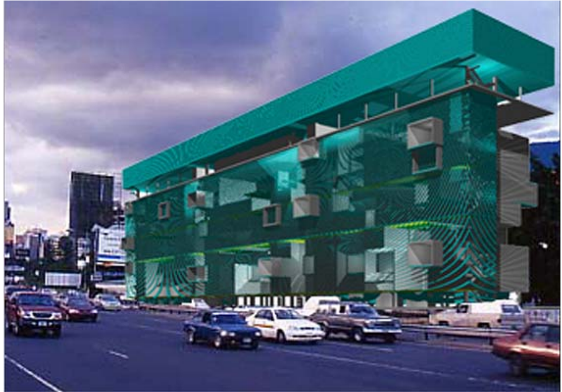
Montage of the residential structure seen by the adjacent highway, south east view

Enclosed in an individual architectural object placed in the city of Caracas, multiple functions aimed to satisfy the demand of the increasing expansion of Telework in developing countries, giving a possible solution to the symptom of metropolitan centralization.