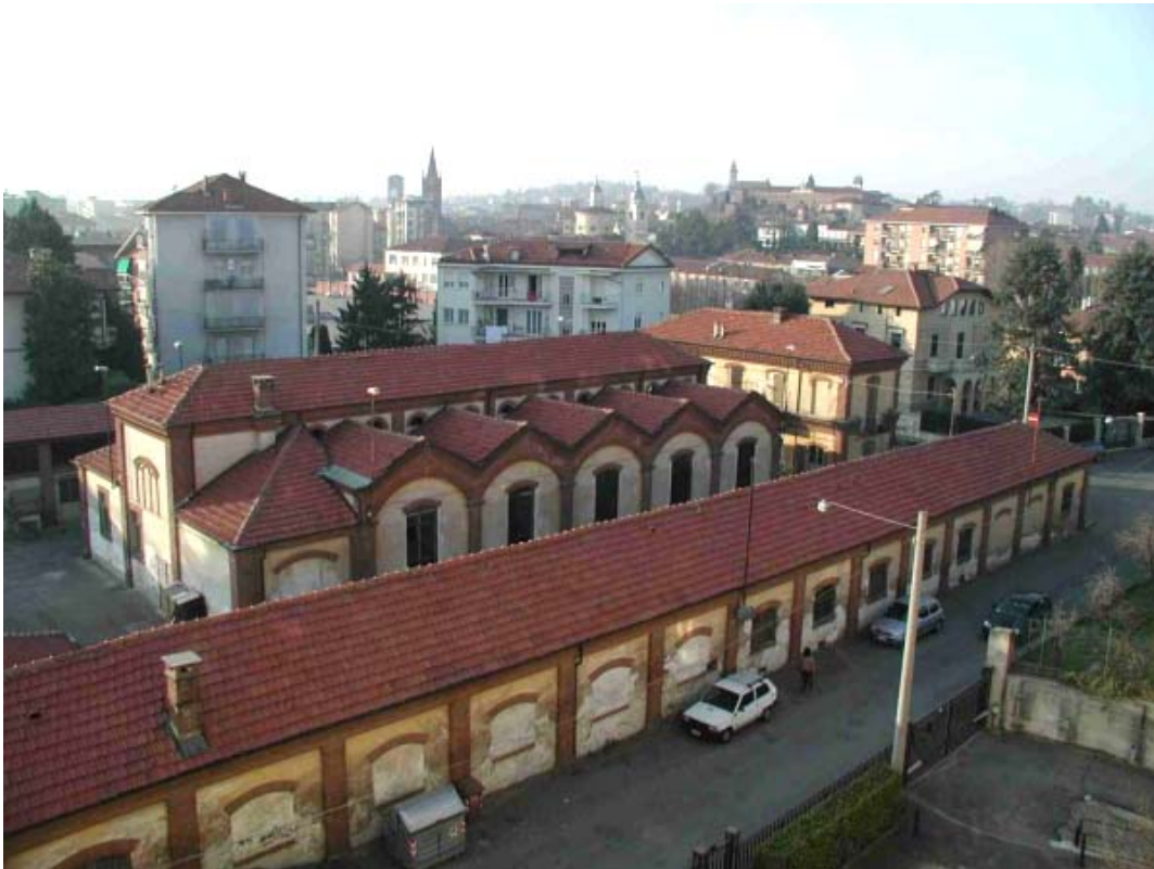
The old slaughter-house of Chieri

The old slaughter-house in Chieri is one such building; it is an example of an old public building that was once outside the town walls, but urban growth has become integrated into the town.