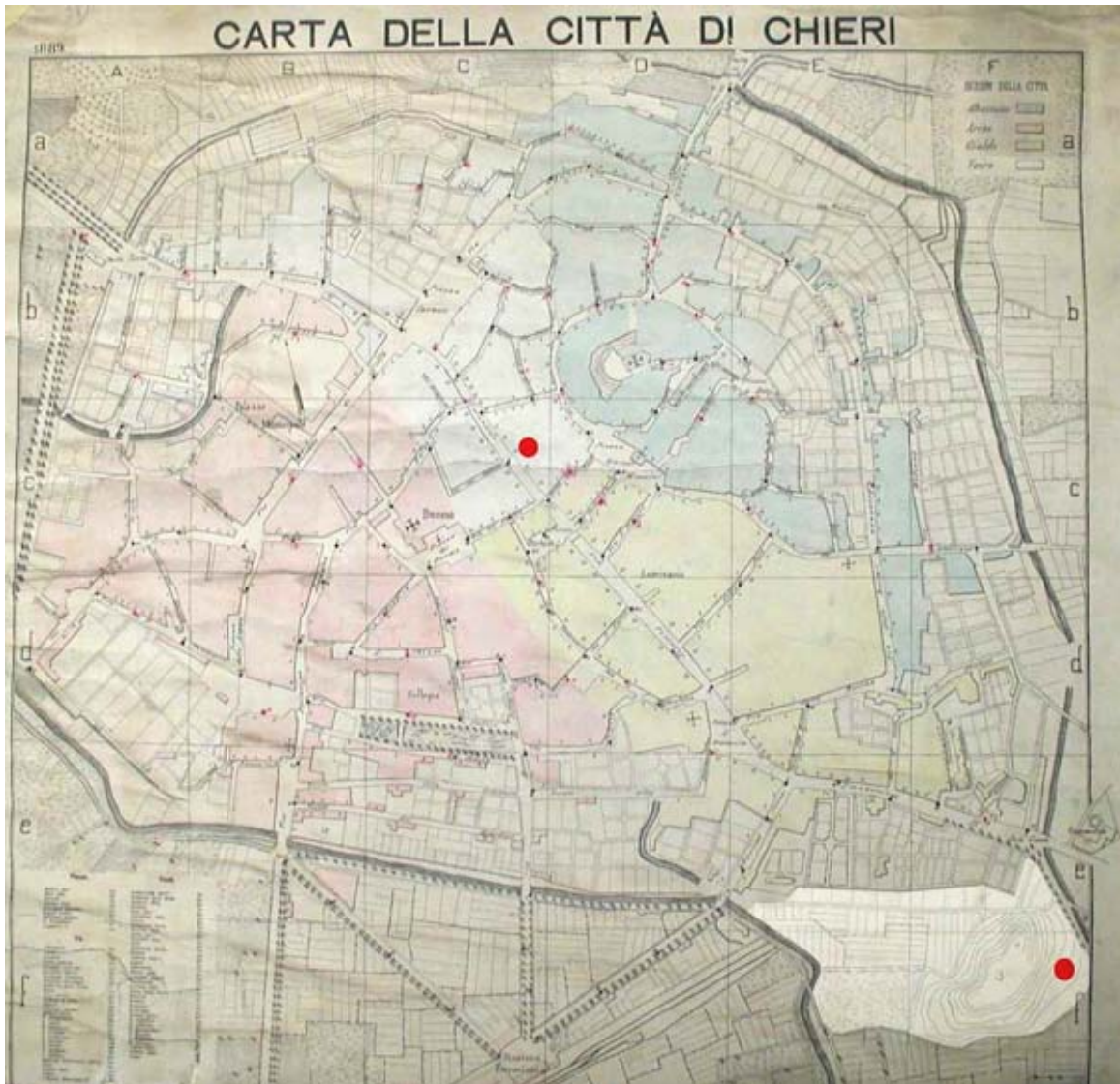
1889, Urban Planning of Chieri; it is highlighted the location, out of the old town walls, where the slaughter-house was built

It was then important to trace the urban development of Chieri and understand the reasons for the presence of this type of public building in this location.