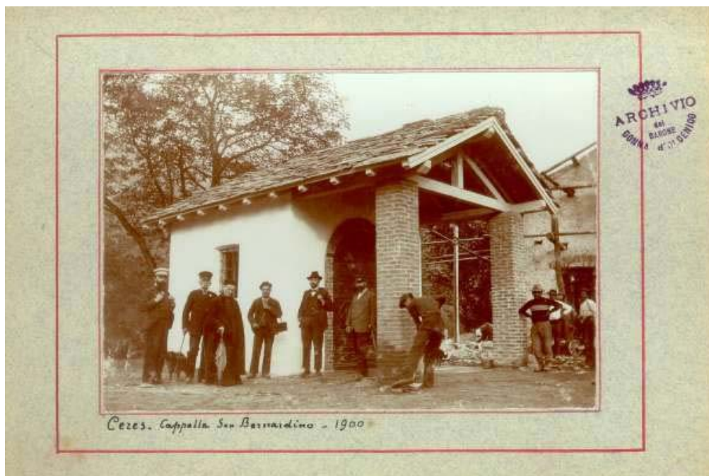
Chapel of San Bernardino in Ceres (1900)

The analysis on these places has consisted in systematic operations of photographic relief of the single religious buildings to verify and to describe the actual situation. The individualization and the cataloguing of the cultural properties has also brought to effect an ampler analysis of the territory in its landscape, urbanistic and infrastructural values. In a particular manner from the comparison among the maps of the land register Rabbini and the maps of the actual land register can be noticed the changes, not only of single buildings, but also of local ways' system during the centuries. In some cases these transformations have not influenced the pre-existence, nevertheless other times they have even involved the demolition of the pre-existent buildings, when they rose on the layout of the new road. On the base of the consulted and analyzed material, an articulated and analytic card has been compiled, for every religious building. For every building are given informations on its history and on its cadastral data; and then there are the geographical position and the analysis of the actual situation both textually described and through photographic relief. The historical photographic documentation has also been reported when it has been possible to find it.