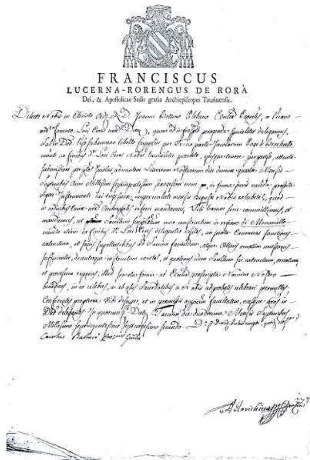
Document of 1769 that authorizes the construction of the chapel of Monaviel (in parish archives of Ceres)

The bibliographical documentation doesn't consist only in the consolidated bibliography, but also in the consultation of the descriptive and illustrated guides for the holiday-makers and the mountain-climbers, of the parish gazettes, and of the historical documents found in parish archives.