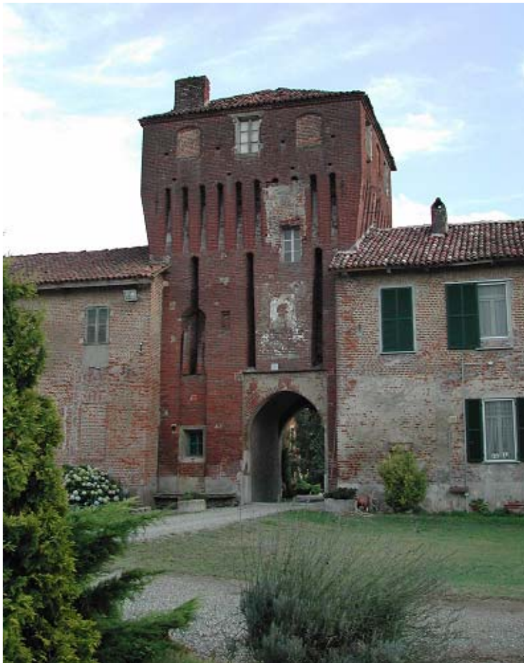
View of the tower, north site.

Darola Grange now Darola Estate still nowadays stands out for an enclosed courts building disposition. Inside you can still see the end 14 th -century four-sided well-preserved tower from which you can have access to all the other courtyards.