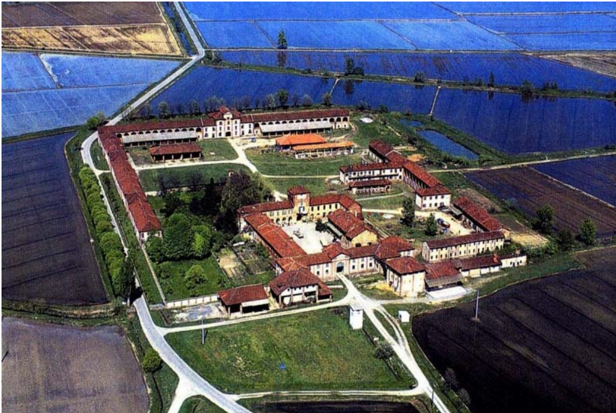
Overview of Estate Darola

Adjacent compounds, which take a wide area (about 40 sqkm) on the territory between Trino and Vercelli, are called: Lucedio, Leri, Montarolo, Castelmerlino, Montarucco, Ramezzana and Darola.