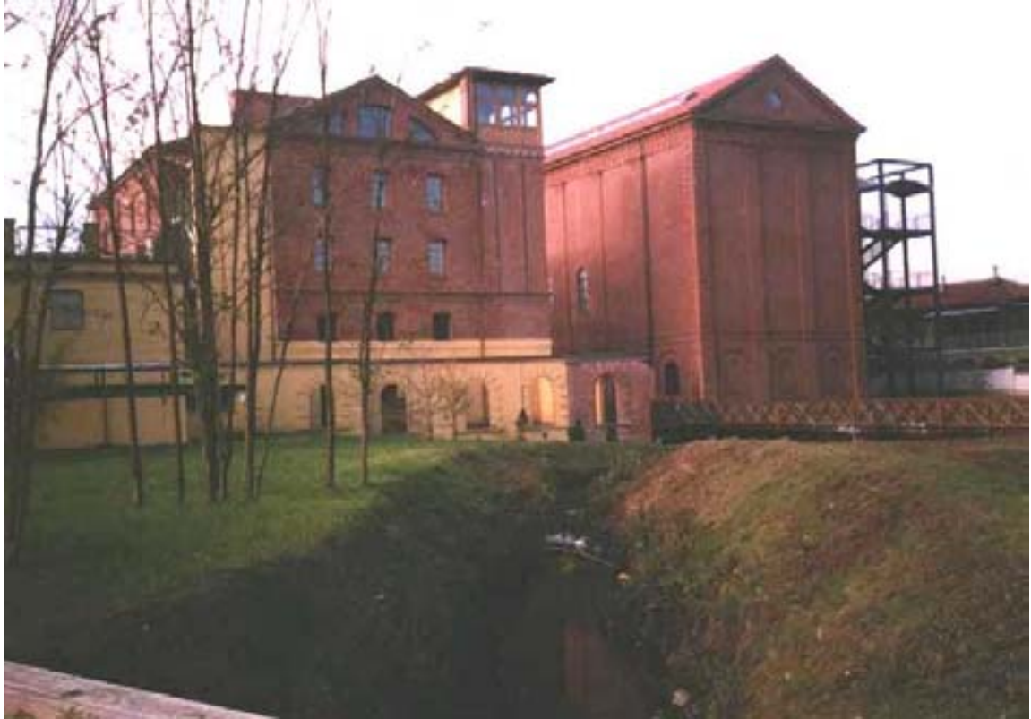
The building complex today, after restoration