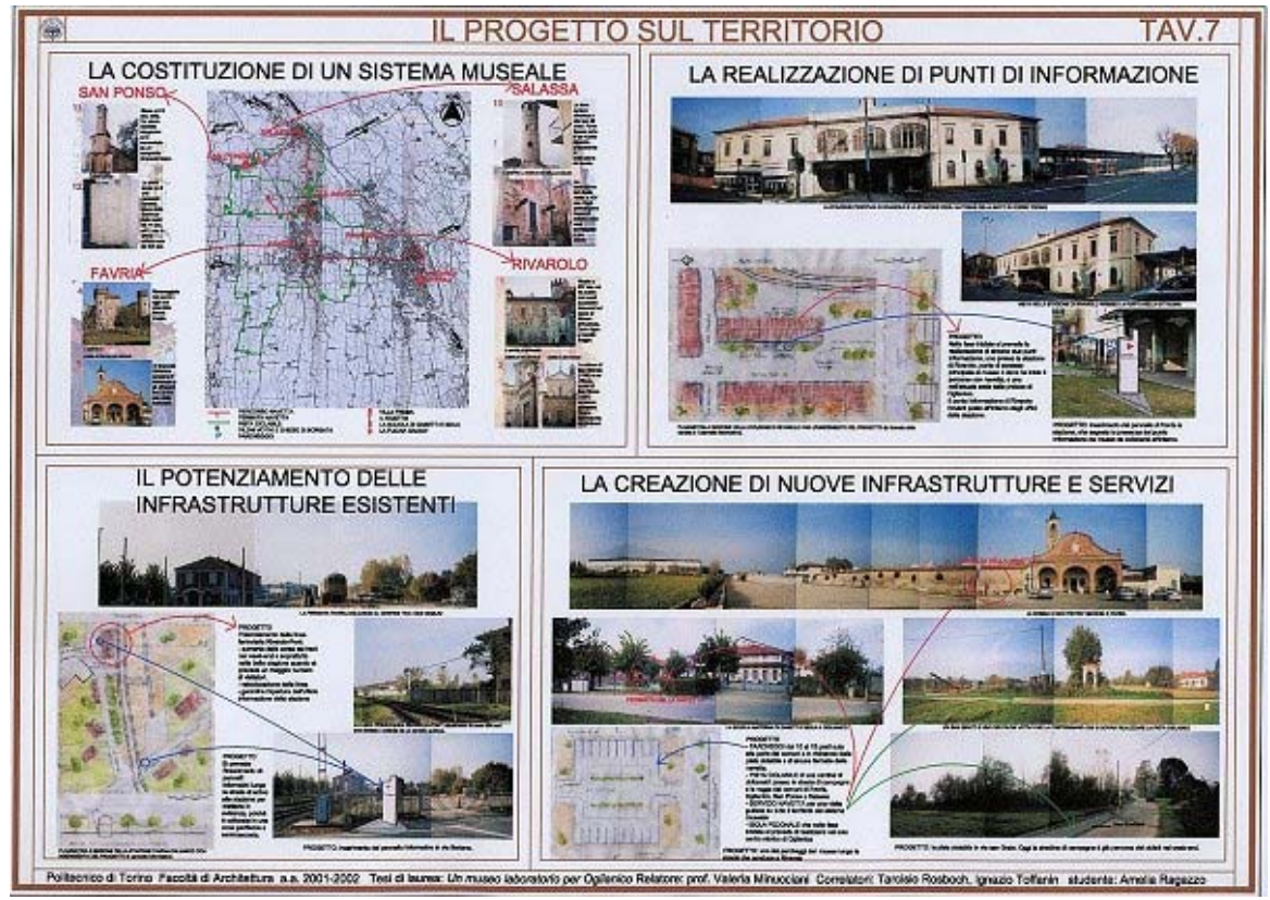
The plan on the territory