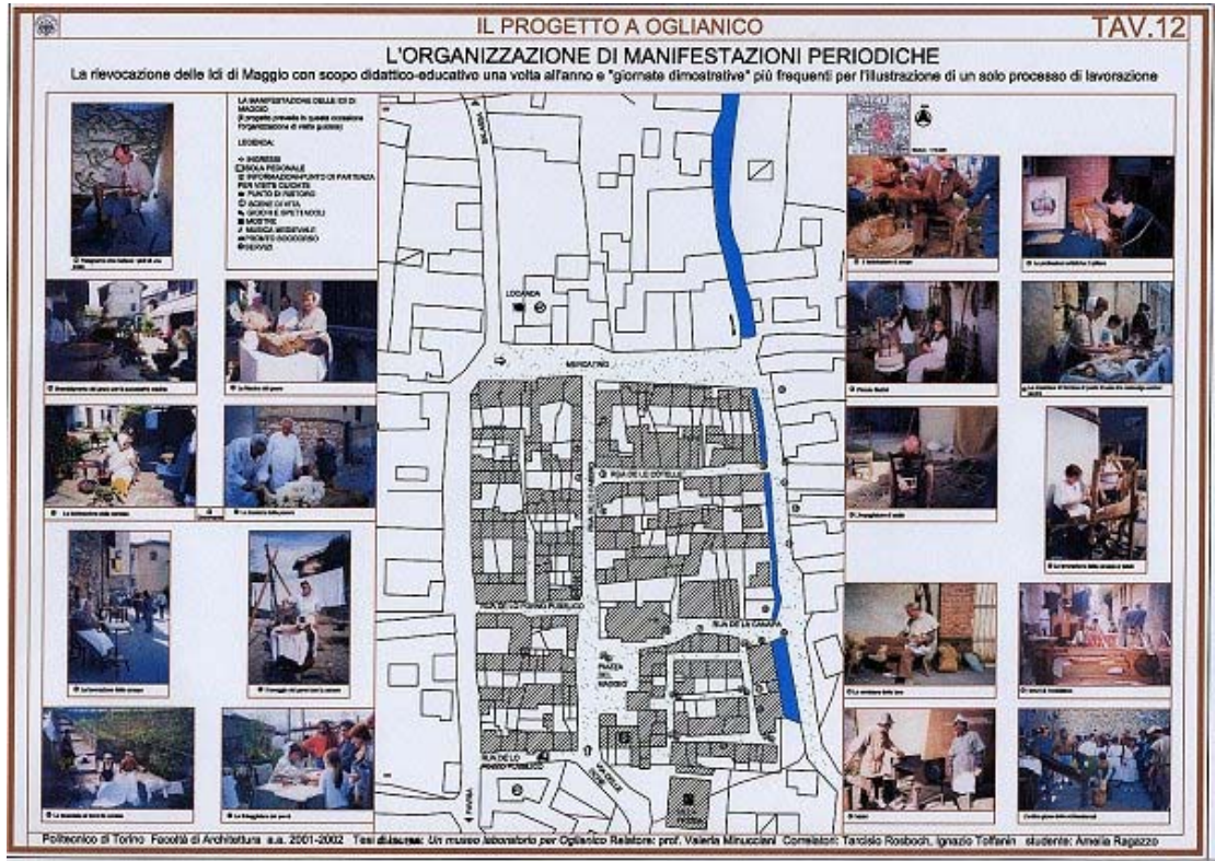
The organization of periodic manifestations to Oglianico

The plan has been faced to a general scale, also considering some lines guide that already imply chosen of greater detail: they are as an example it indicates to you material, it arranges of lighting system and references for the planning of punctual elements like the logo, the penthouse of the shuttle and other street furniture.