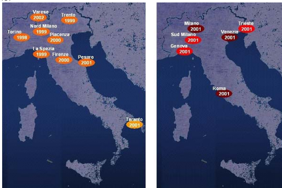
Representation of the strategic plans (image of left) and plans with strategic contents (image of right) running in Italy nowadays

Always with reference to the Italian experience, what strikes the attention it is the trust that is put back from the operators of the sector in such tools. Above all from who these plans elaborated and promoted, the strategic planning is proposed as 'the attended solution', the tool through which recover of effectiveness of public decisions.