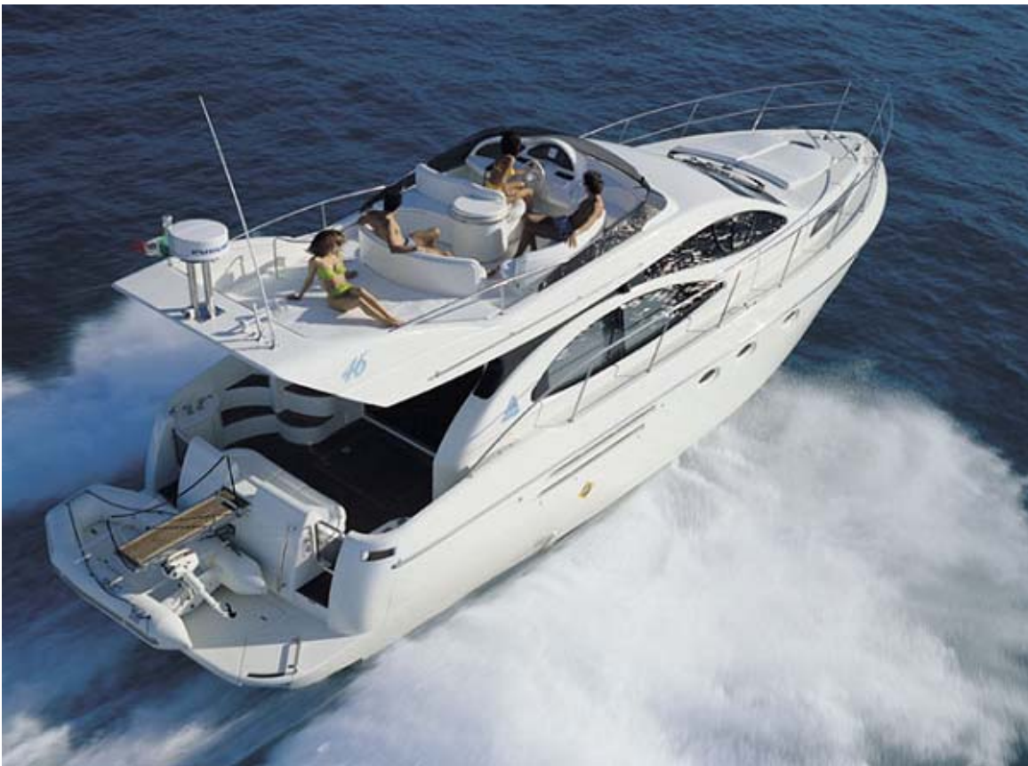
The model Azimut 46.

The idea to develop the watercraft's studies came by some deep considerations. From one side the increase, near the natural sailer, of new sea's character, appasionated fishing and sea's excursions and sports activities connected to them; from the other side the consciousness that the italian nautical area, crowing year by year in incredible way, and not only for the success of Luna Rossa in the Louis Vitton Cup, it is taking place and attention always more from the project's world and industrial desing. To get nearest to this reality, for geografic position too, we get in contact with Azimut's shipyard in Avigliana, leader in projecting and building of motoryachts. Here where it's borned the idea to redefine in particular the motoryacth's functions of the Azimut 46 (a model of medium metrical, total lenght 14,93), to satisfy new needs.