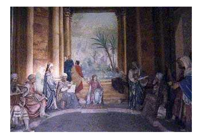
Chapel XII - Jesus's disputation in the Temple (inside)

Today the Holy Mount is completely different from the original plan. The XIX century upheavals have changed the scenographic setting, increasing, through a grown sensibility for the natural scene of the Holy Mount, the aspects connected to the pilgrims' active and emotional presence, which is signed by a constant exchange of the actor for the spectator. The theme itself around the Holy Mount goes from a Marian exaltation to a Rosary representation. So along the Holy Way, now signed by 23 chapels, besides the five joyful, sorrowful and glorious mysteries based on the New Testament, we can find some different religious subjects: two episodes about Saint Eusebio's life, one episode based on the Old Testament, five stories based on the Apocryphal Gospels. Whereas there are only five chapels left on the "Way Back", built to let the pilgrims have a different route to follow on their return and to have one more opportunity to meditate on Holy Martyrs' or Eremites' life episodes.