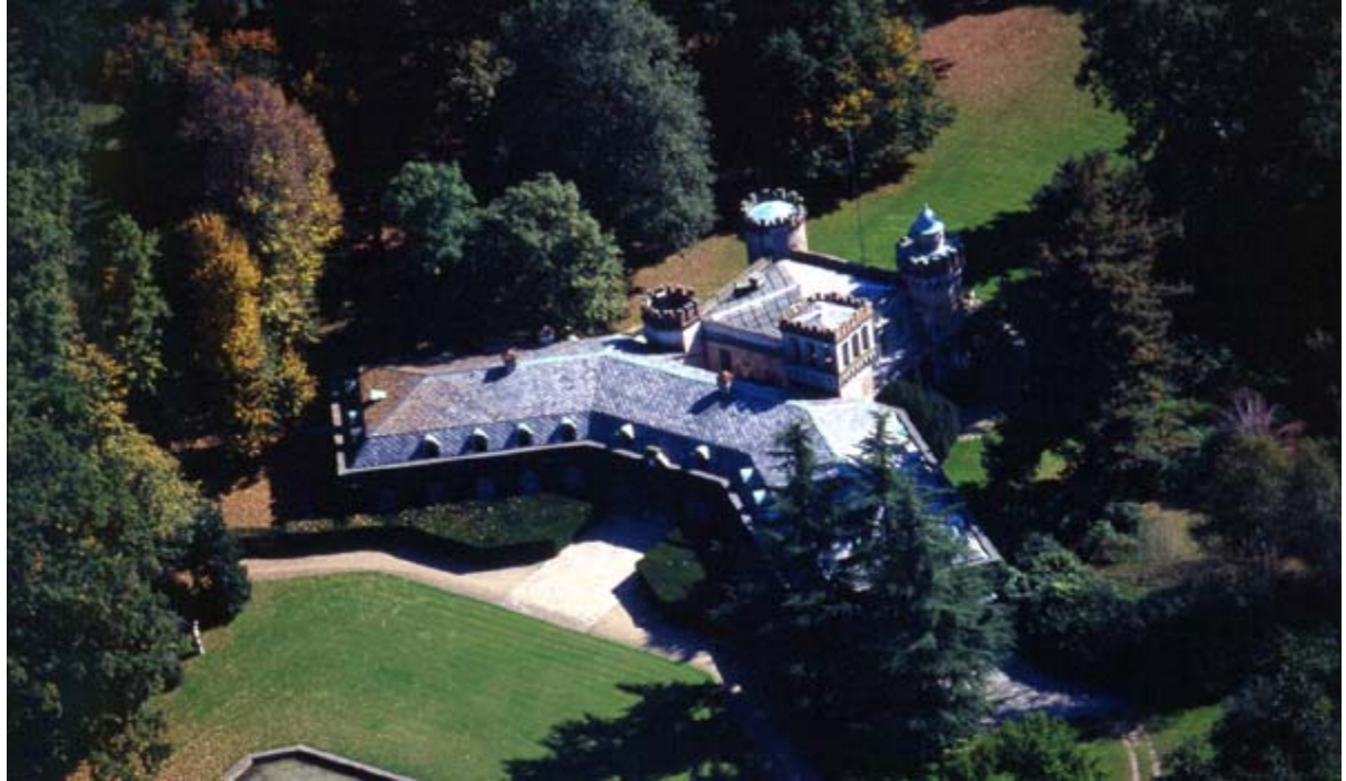
Aerial view of the castle of the lakes.

The restoration of the building deals with different specific field: the treatment of fabric and pottery that cover many rooms' walls and the delicate restoration of external painted plasters that suffer different kind of deterioration, depending on the geographic exposure but mostly on the previous operation made on the building during the past years.