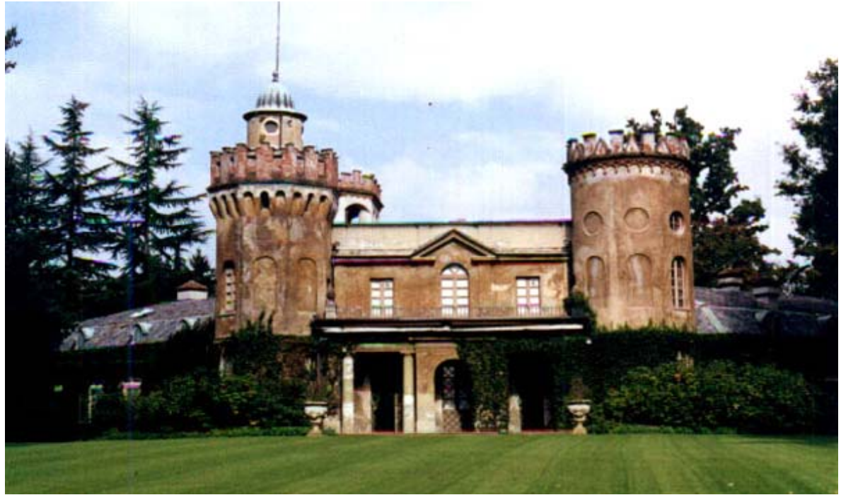
The castle seen from the store of the lake.

The Castle of the Lakes is built in the east part of "La Mandria" regional park. With its garden and connections, it has been part of the process of reorganization of the whole estate carried out by Savoyard King Vittorio Emanuele II in the sixties of nineteenth century. Nowadays, aiming to its hypothetic restoration requires to face different subjects: the recently built construction, the original parts of the nineteenth century castle and, finally, those who suffered heavy adjustments during the works of enlargment of the original building in the latest 70s. The expression "restoration of restoration" is meant to show that a most interesting and cospicuos part of the analysis on the building deals with those structures, decorative elements and surfaces that, somehow, have been previously restored.