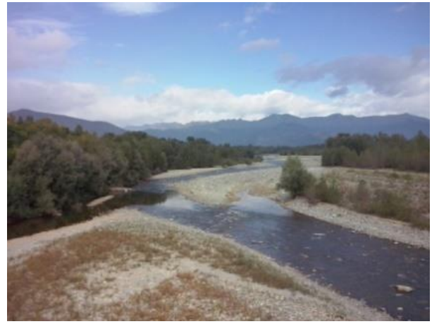
FIG.2 – Banks of the stream of "Stura di Lanzo" in Venaria Reale.