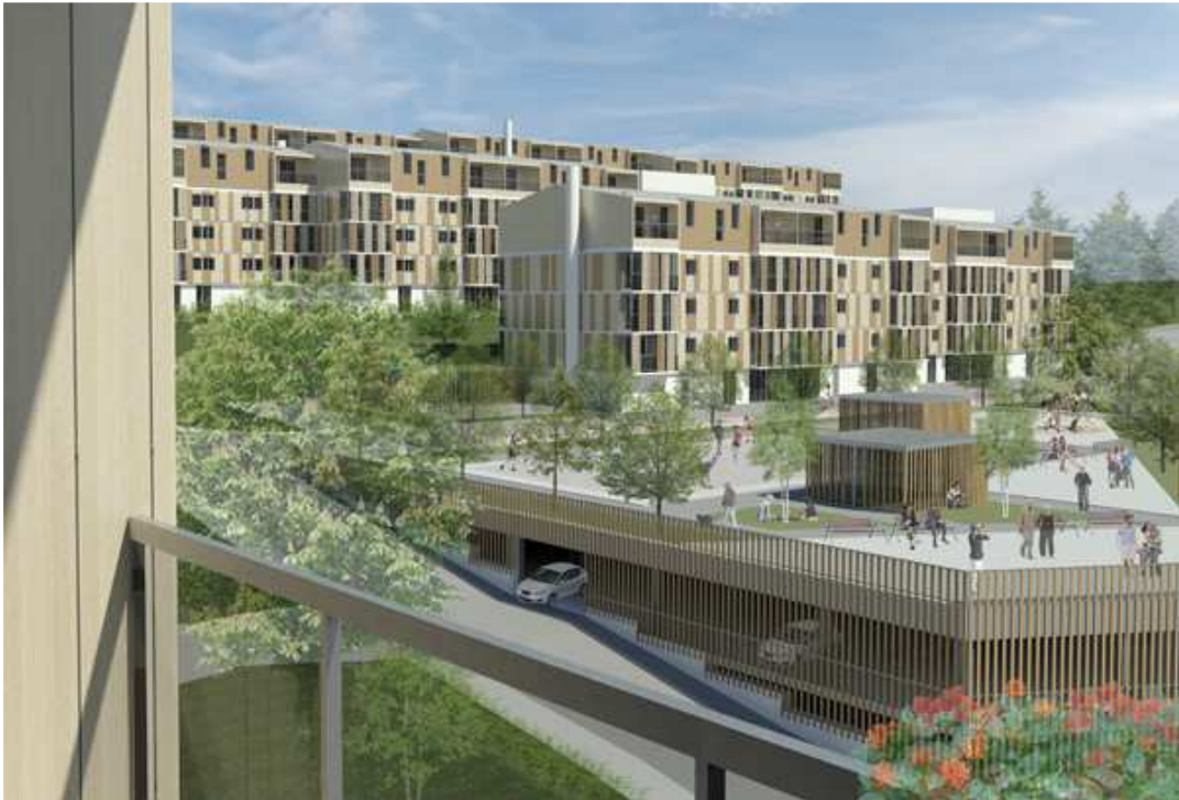
Photorealistic 3D rendering by the upper storey