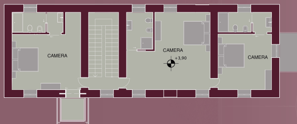
PIANO SECONDO 1:100