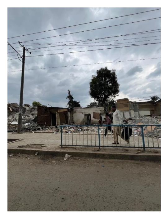
Figure 7-Demolition of neighbourhoods for the new urban project-Addis Abeba 2024-Camilla Paris