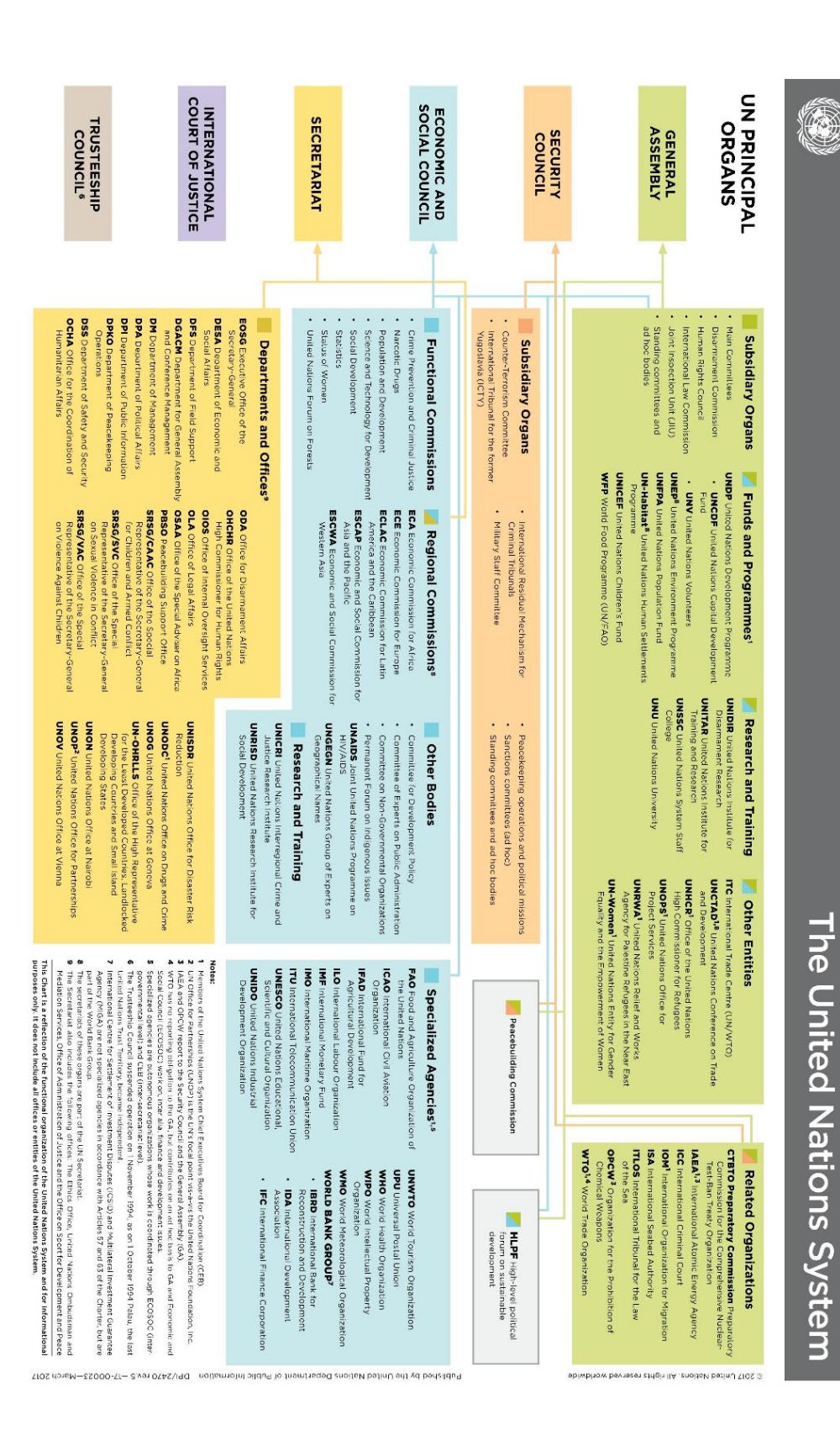
Figure 1- UN Structure- source from: UN Organization Chart - United Nations, n.d