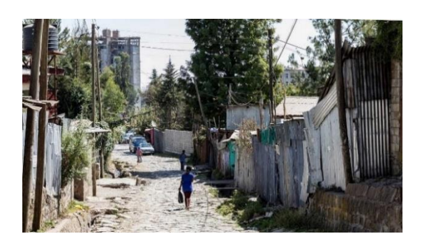
Figure 3-Example of the city of Addis Ababa Ethiopia. Camilla Paris - Ethiopia, Addis Ababa, December 2023

• Urban expansion: Cities are expanding rapidly, often without proper planning. This leads to uneven growth and inefficient use of urban land. Urban expansion in Africa is rapid and often uncontrolled, leading to territorial imbalances with sharp contrasts between rich and poor areas. Western-style skyscrapers stand next to vast areas of slums and shantytowns (Oltremare, 2021).