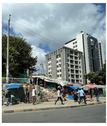
Figure 4-Example of the city of Addis Ababa Ethiopia. Camilla Paris - Ethiopia, Addis Ababa, December 2023

In fact, many African cities lack effective urban plans and proper urban management. Many urban plans in Africa have been developed using Western models, which almost always do not fit the local context (Fig. 1/2).