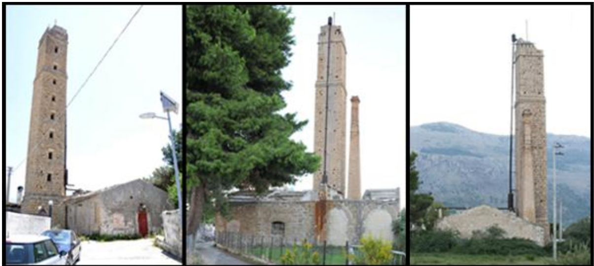
Water machine Maurigi - from left: west side, south side, east side

Few people know the historic agricultural structures, in particular “the machine of water” also called “water machines”. This type of structure was very widespread in the province of Palermo and specifically in the plain called "Conca d'Oro". Water machines were closed over time and their working was completely transformed. Water machines originated from farming systems dating back the Arabian domination; a real management of water aimed to irrigate fields, above all for citrus fruits farming, which have always been the main element of the local economy of the territory of Palermo.