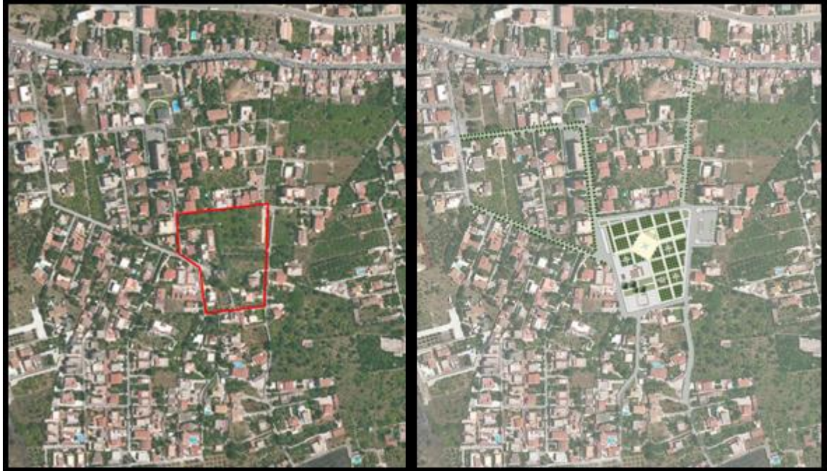
From left: area of intervention - project idea

The idea to realize an urban park with a multifunctional space originated from the need to bring back to the citizens an usable historical restored factory and at the same time from the desire to offer a little paradise, a green space within a residential area, which can be considered as "own" by the inhabitants of the place and not only.