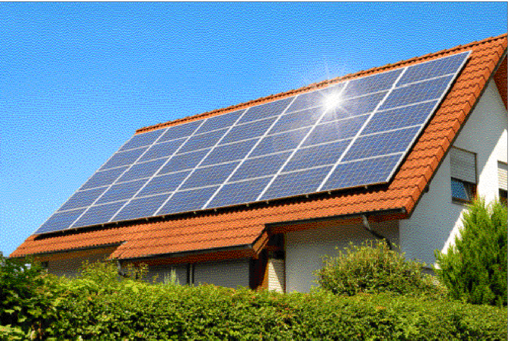
PHOTOVOLTAIC PANELS REFERENCE

«pannelli-solari24.it» Retrieved March 04, 2024, from https://www.pannelli-solari24.it/pannelli-solari-prezzi/pannelli-fotovoltaici-prezzi/